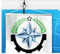
ZAO Scientific Production Enterprise name M.I Platov, Russia